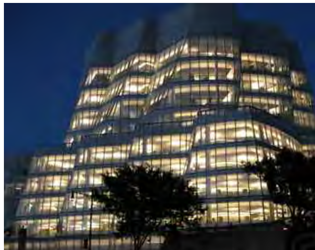
Frank Gehry's new IAC building is at the West Side Highway and 18th St., directly across from Chelsea Brewing Co.