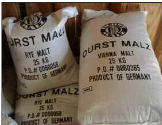
The malts are stored in a shack on the roof. The grinder feeds them straight down to the brew kettle, seen above with Kurt. While the brewery's base malt is from Gleneagle in Scotland, much of the specialty malts are from Germany.